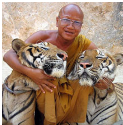
Tiger Temple Buddhism & Big Cats - Kanchanaburi, Thailand