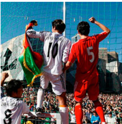
Work the Homeless World Cup Pitch in on the Pitch - Melbourne, Australia