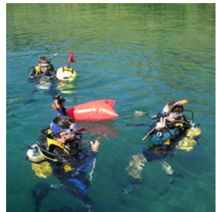
Marine Ecosystem Study Underwater Photography in Paradise - Gau Island, Fiji